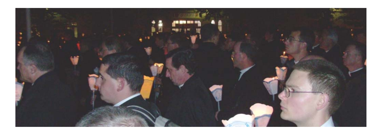
Bishop de Galarreta