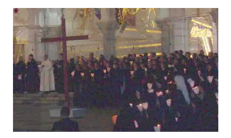
Clergy of the SSPX