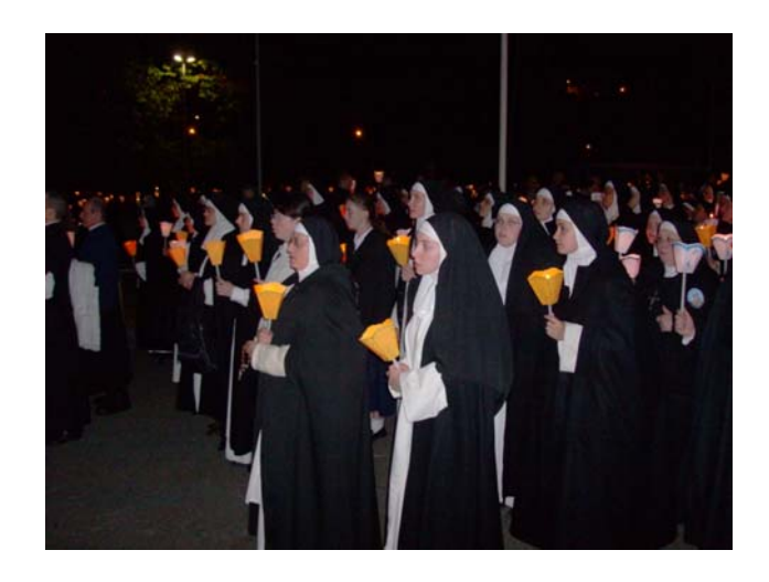
The Dominican nuns in the conciliar procession