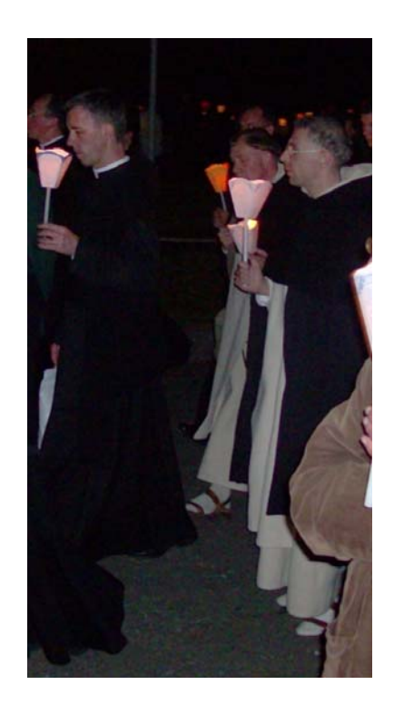
Avrillé in the procession