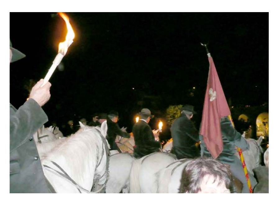
The procession of the conciliar Gardians mixed with that of the SSPX

« The sound system again transmitted the meditation of the mysteries of the rosary. Each decade – the word 'mystery' was never used, it was rubbed out - introduced with the reading of some verses of the Holy Gospel by a man, and then a woman gave a short (one or two phrases) meditation. Everything was repeated identically in four or five languages.»