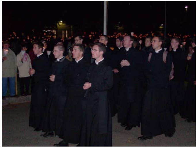
The seminarists of Ecône in the snare procession