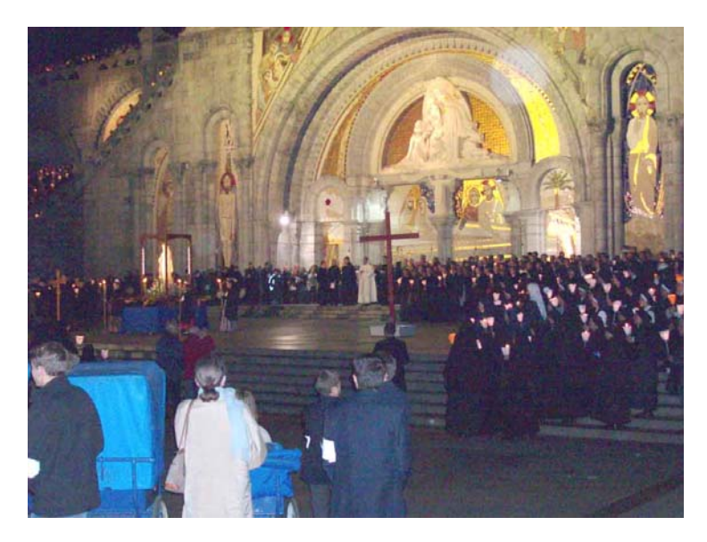
The clergy of the SSPX behind the conciliar counterfeit priest